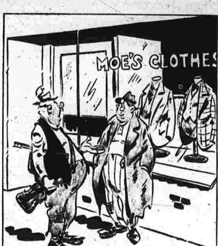
"Only a jitney he gives me—and me playing an original composition, too!"